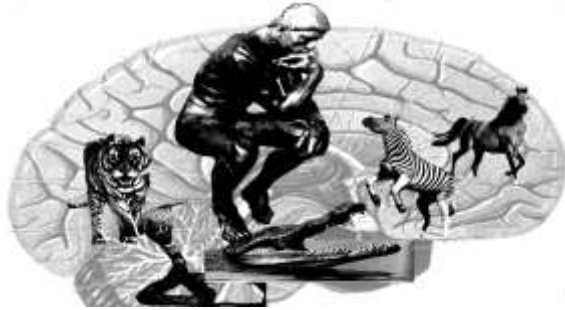
Fig. 2. The trial brain of universal animal (reptile complex, limbic cortex and person cortex)

Therefore, extreme care (caution) is necessary at intervention of the person in nature. At the same time, it is necessary for humanity to pay special attention to problem of modern and future devolution of the Earth and of the Universe: probably, it is impossible to encourage devolution on the Earth by replacement of nature, growth of artificiality of environment and life, disappearance of species, etc. It is necessary to investigate processes of devolution of Earth, solar system, near and distant space to reveal directions of devolution and reciprocal actions of humanity with the purpose of its preservation together with nature of the Earth. The philosophy of binary plurality of the World with its branching evolution and converging devolution promotes an explanation of opportunity of more objective interaction of the person with the World.